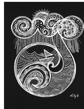
"And the ship went out into the high sea..." by Molly Zakrajsek