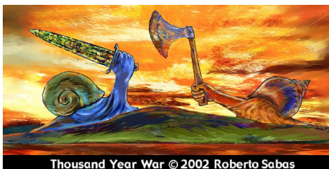
Thousand Year War