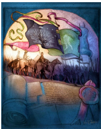
Captains of the West by Will Coats

https://tolkienconference.com/art-gallery/